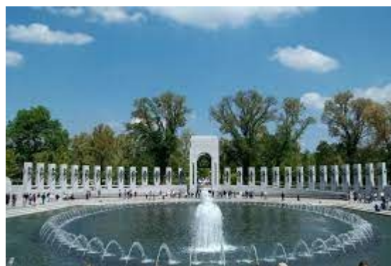
NATIONAL WORLD WAR II MEMORIAL