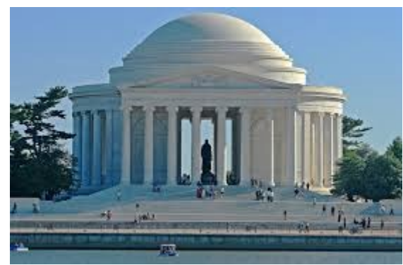
THOMAS JEFFERSON MEMORIAL

**Bonus: In 2011, a memorial was added to the National Mall. It was the last memorial that would be added to the National Mall. To whom was it dedicated (Hint: He was not a president and was alive during World War II, the Korean War, and part of the Vietnam War, but did not fight in any of them)