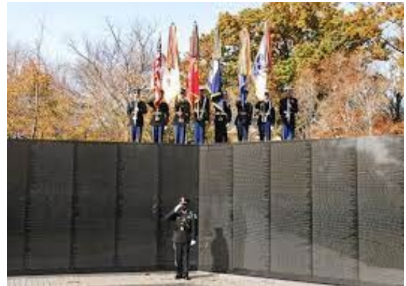
VIETNAM VETERANS' MEMORIAL